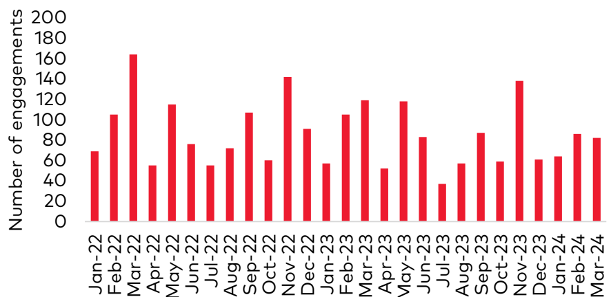
Source: Vanguard, from 1 January 2022 to 31 March 2024.

From 1 January 2024 to 31 March 2024, 232 engagements with the fund's held names were conducted on a broad range of ESG topics.