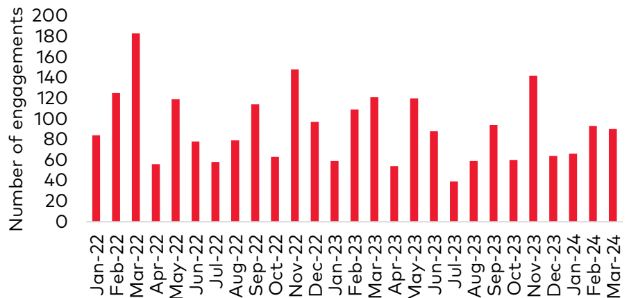
Source: Vanguard, from 1 January 2022 to 31 March 2024.

From 1 January 2024 to 31 March 2024, 249 engagements with the fund's held names were conducted on a broad range of ESG topics.